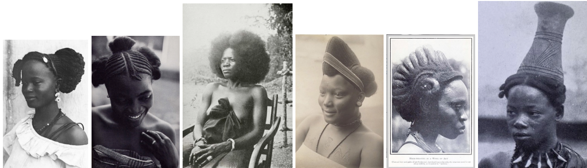
From left to right: Wolof Tribe Woman, Mende Tribe Woman, Mandingo Tribe Woman, Yoruba Tribe Woman, Two(2) Igbo Tribe Women

Hairstyles could signify differences in religion and even marital eligibility. It was also a communal practice that brought a trust and bond unlike no other. If one was allowed to do someone's hair, that meant they were a trusted friend, which is a theme that plays out even today in Black hair salons and homes throughout America. Through ethnographic data, it was found that many Black women are very skeptical to allow women whom they do not know touch their hair for fear of hair or scalp damage such as, the hair being braided too tightly or the hair being cut too short. This same attitude was and is still very present in African culture because the hair is very treasured. The amount of time spent on the hair correlated with the intricacy of the braids or locing which showed the amount of time one had to do hair rather than work. This, in turn, showed one's status in the community. Below are some examples of hairstyles from African tribes that soon became American slaves in the 1600's: